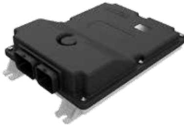
APC300 Electronic Controller

Spicer electronic controls enable OEMs to offer a complete range of best-in-class controls, such as diagnostics, system monitoring, load- and speed-compensated automatic shifting, shift overlap control, electronic inching, and automatic throttle up. Spicer controls enable communication between driveline components to